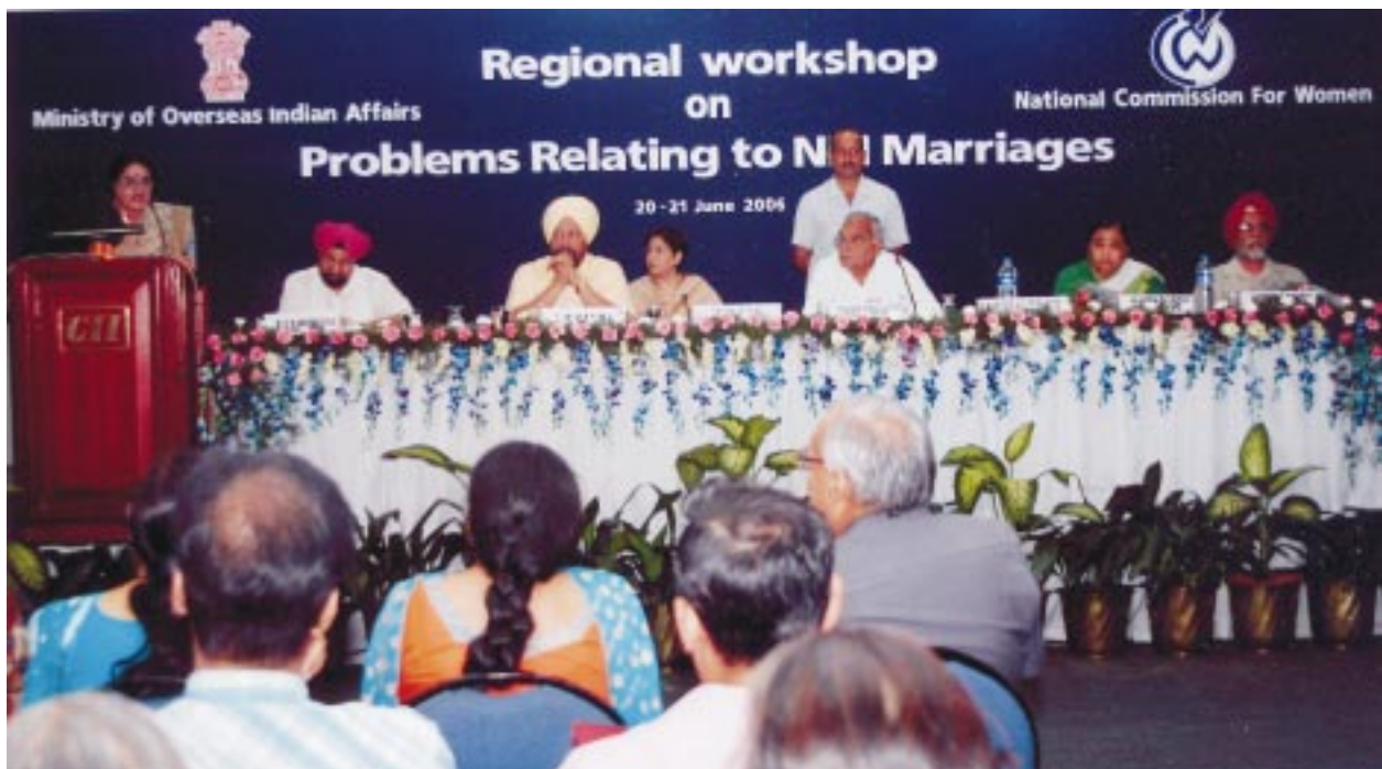
Dr. Girija Vyas, Chairperson, National Commission for women, addressing the regional workshop on problems relating to NRI Marriages held at Chandigarh

The persisting division of 'private' versus 'public' spaces which views the entry of law in homes as "bull in the china shop" has been largely responsible for keeping the homes considerably insulated from the legal system, notwithstanding the fact that some of the grossest rights' violations happen within the 'sacrosanct' four-walls of the homes. This dilemma, coupled with the sensitive and delicate nature of matrimonial relationships per se, are largely responsible for making the entire gamut of matrimonial disputes one of the most challenging and complex areas for legal intervention within any system. What makes it further complex particularly in the Indian context is the fact that in the absence of uniform civil laws, the personal laws of each religious community continue to be different in this country, thus making the matrimonial disputes, especially in inter-religious marriages, even more difficult to deal with.