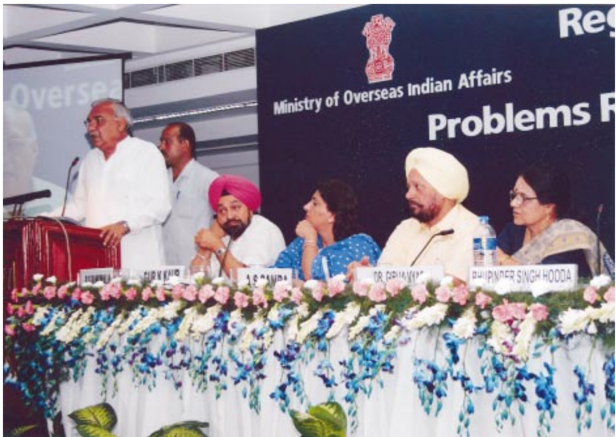
Shri Bhupinder Singh Hooda Hon'ble Chief Minister Haryana addressing the delegates at the regional workshop at Chandigarh

The National Commission for Women during the year 2005-2006, took up this issue as a priority area, requiring immediate intervention and solutions and conducted two workshops at Chandigarh and at Trivandrum, in June and September 2006, in collaboration with the Ministry of Overseas Indian Affairs, to discuss the possible solutions to the vexed issue.