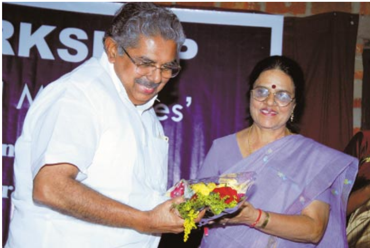
Dr Girija Vyas, Chairperson National Commission for Women, welcoming Hon'ble Minister of Overseas Indian Affairs at the regional workshop on problems relating to NRI Marriages Held in Trivandrum, Kerela

On basis of the recommendations made during the workshops the Commission recommends the following measures which need to be adopted.